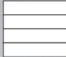
ONE CAR DESIGN