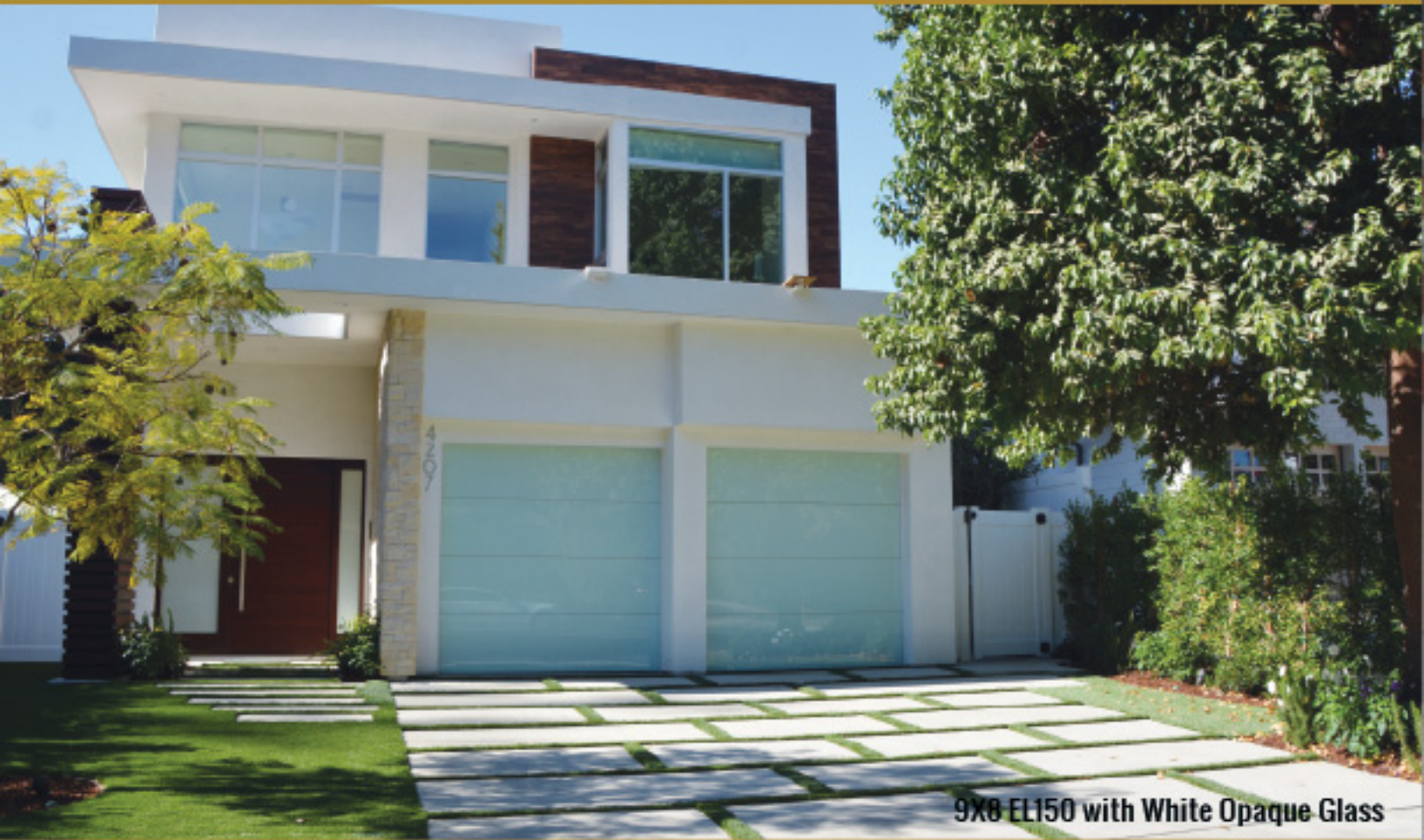
9X8 EL150 with White Opaque Glass